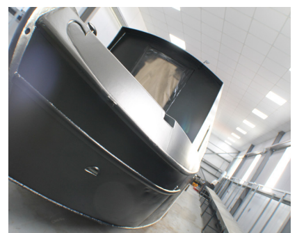
Finished boat after painting