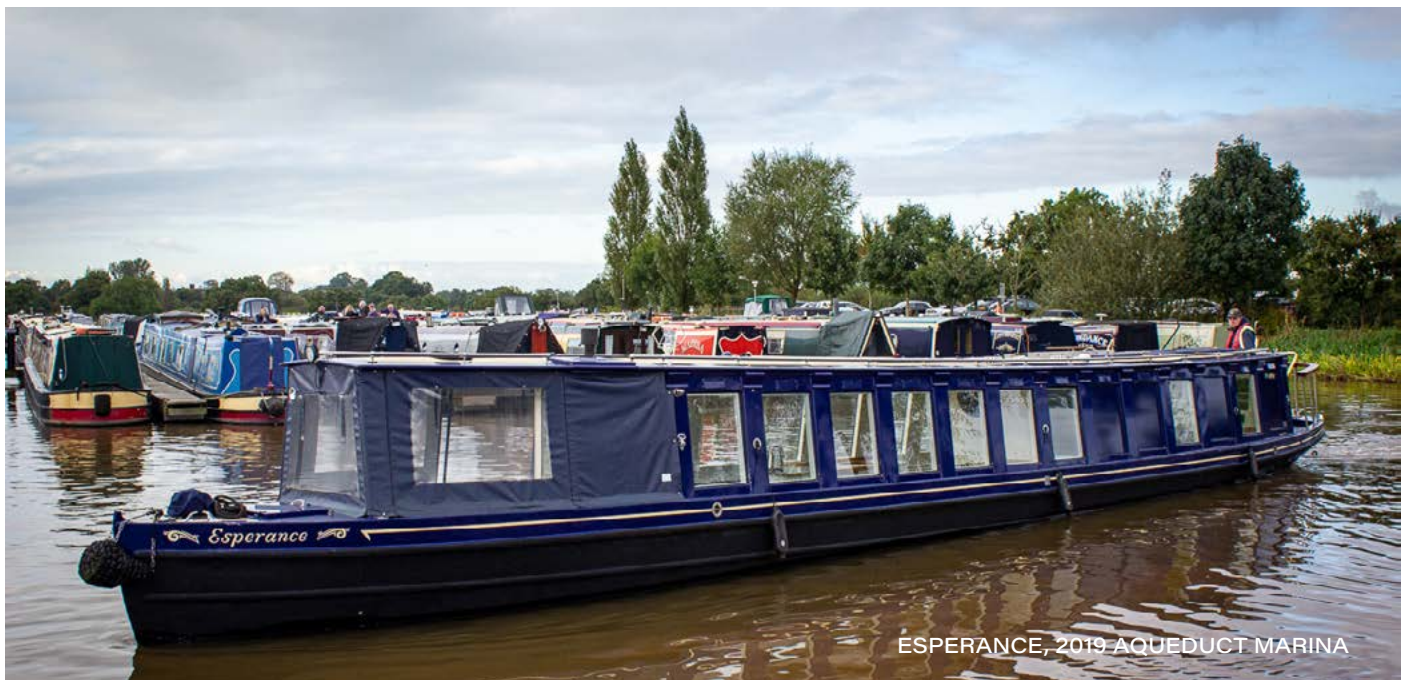
ESPERANCE, 2019 AQUEDUCT MARINA