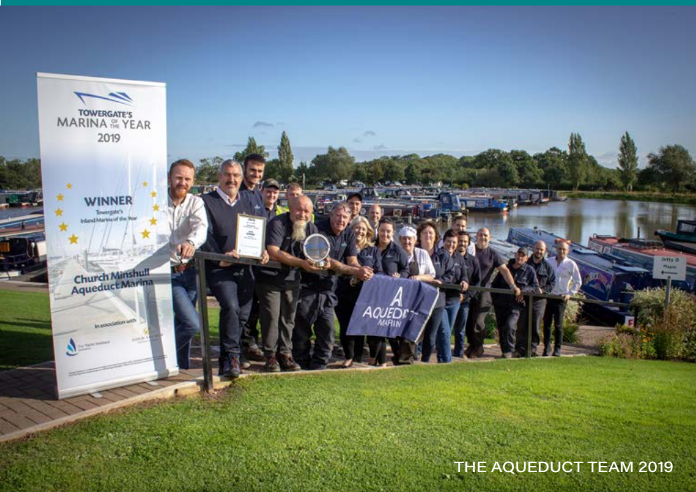
THE AQUEDUCT TEAM 2019