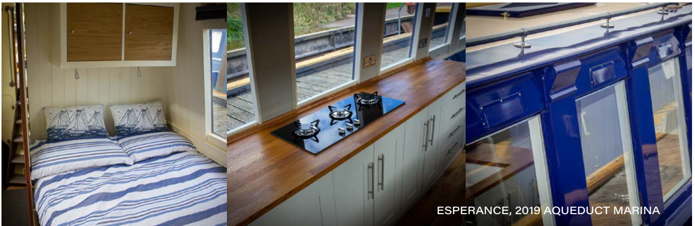
ESPERANCE, 2019 AQUEDUCT MARINA