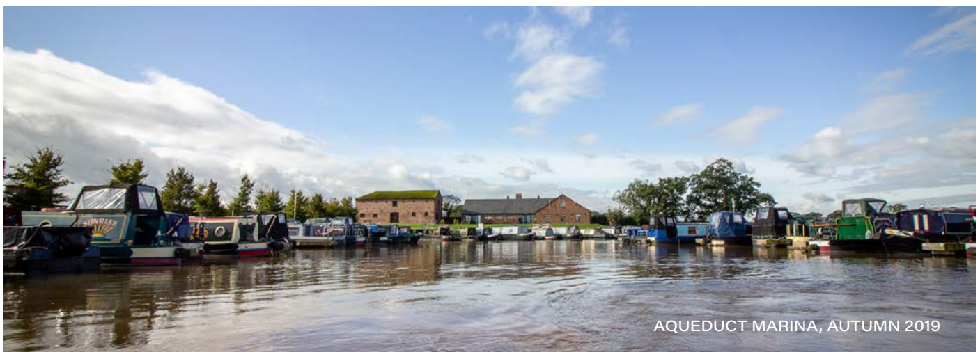
AQUEDUCT MARINA, AUTUMN 2019

ONLINE SHOP NOW OPEN VISIT WWW.AQUEDUCTMARINA.CO.UK/CHANDLERY