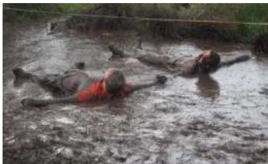
Tough Mudder 2017

To sponsor us please call into Reception. Thank you!