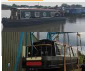
Woodfalls (top) and Peg

www.aqueductmarina.co.uk/aintree-beetles