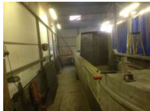
Work in progress on Amerton

For more details about the maintenance services which we offer onsite please visit www.aqueductmarina.co.uk/narrowboat-maintenance