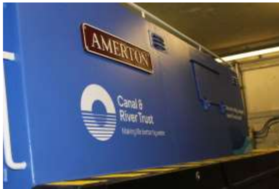
Work in progress (left) and the finished cabin side with the new logo (right)