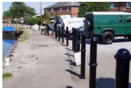
Tall bollards that were painted

However, perseverance was rewarded and the steps were duly completed. There were many tall bollards; many of them had red rust on one side. These were painted – and touched up on the following day. A long stretch of quayside mooring needed serious rust removal before painting. An old fence runs round the area, keeping the unwary off the steep bank. This also needed some work before painting could begin, but the end result was quite pleasing in spite of some holes in the uprights!