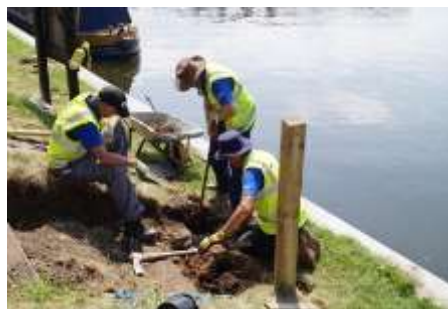
Moving the boulder

After a brief interlude whilst some members went cruising (and CRT reorganised!) July saw us visiting Acton Bridge on the River Weaver. There were several jobs to be done, though it was very hot! The old steps needed rebuilding. This proved more difficult than it seemed at first sight, as there was a big boulder buried just where the bottom step needed to be.