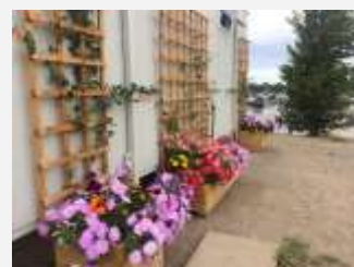
Woody's growing success

Our trusted groundsman Woody has been busy this season growing a vast array of new flowers and climbers on to our workshop offices. Make sure you pop over and take a look!