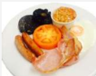
A Galley Breakfast

To redeem, simply call into the Galley between 10.00 am and midday, Monday to Friday order from our breakfast menu and leave the rest to us!