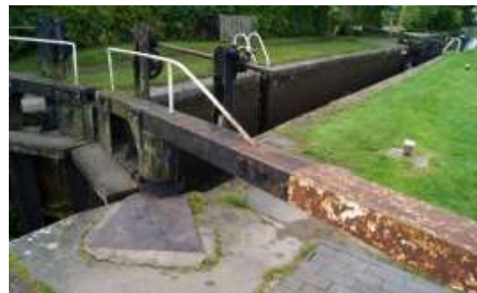
Swanley before work started

The farmer kindly allowed parking in his yard and the arrangements with CRT included a new and