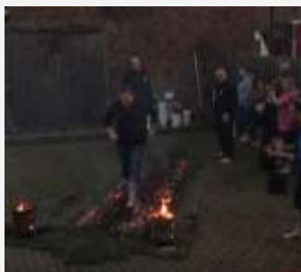
Brave fundraiser taking on the St Luke's Firewalk at Aqueduct Marina

Congratulations to the 15 fire walkers who raised £3,500 for St Luke's Cheshire Hospice!