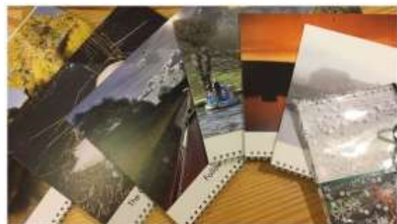
Photo competition calendar images

Make sure you grab yours now before they all go!