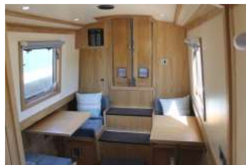
The Aintree Beetle

For more details visit www.aqueductmarina.co.uk/25ft-beetle-available