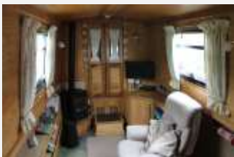
Ramyshome - £49,995