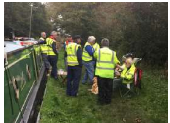
A welcome break