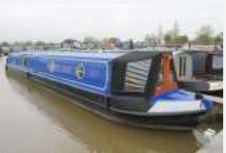
Far From the Madding Crowd - £54,995