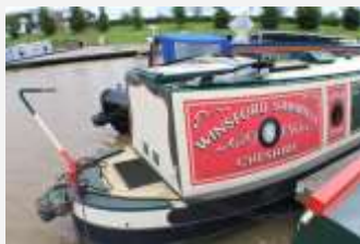
Toad - £99,950